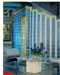
Stair-stepped panels of Hy-Lite block serve as the perfect backdrop for a casual sitting area.

Hy-Lite PRODUCTS, INC. Discover your imagination.