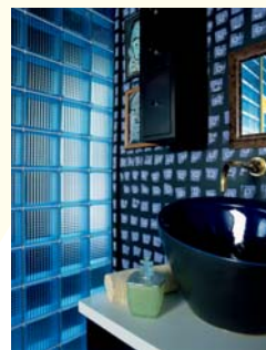
A panel of blue cross rib acrylic block adds privacy to the bathroom.

"The house is continually open for tours, street association meetings, art classes and other gatherings. Eventually we'd like to dedicate it as a museum to preserve unique art forms."